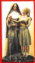
Catherine McAuley founder of the Mercy Order